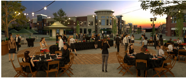
This image is a 3D rendering, not a photograph.